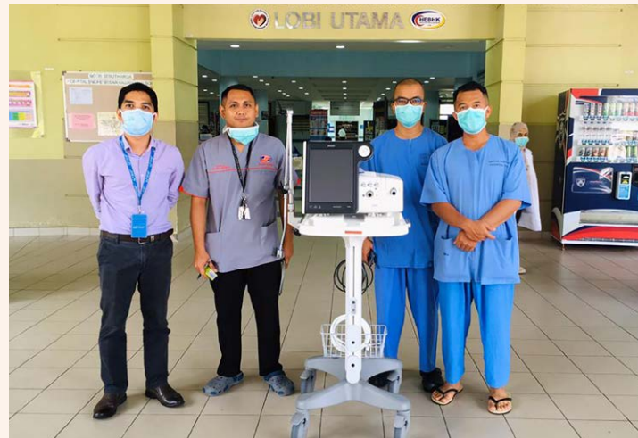
Pantai and Gleneagles Hospitals have collectively loaned 20 ventilators to public hospitals for the treatment of patients in their Intensive Care Units.